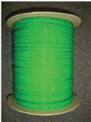
GCP.400 High Speed Door Pull Cord Industrial Grade. 250 foot roll.

This product is an ABS plastic , extruded to .400" in fluorescent green. Easy to grab, and most of all, easy to CLEAN. Any of your standard in-house cleaners as well as medical grade can be used to clean this product. No more excuses for dirty door actuators.