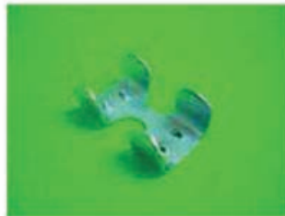
GCP.403 Clamp for Industrial Pull Cord