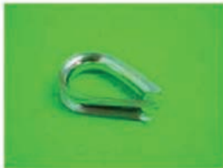
GCP.402 Thimble for Industrial Pull Cord